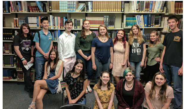
Media Students at Roxbury Media Conference