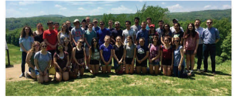
AP History Students at Hyde Park