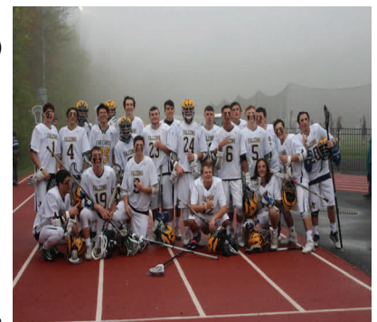
Boys Lacrosse Champions