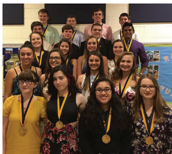
Class of 2017 - Top Twenty